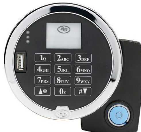
A-Series with Display